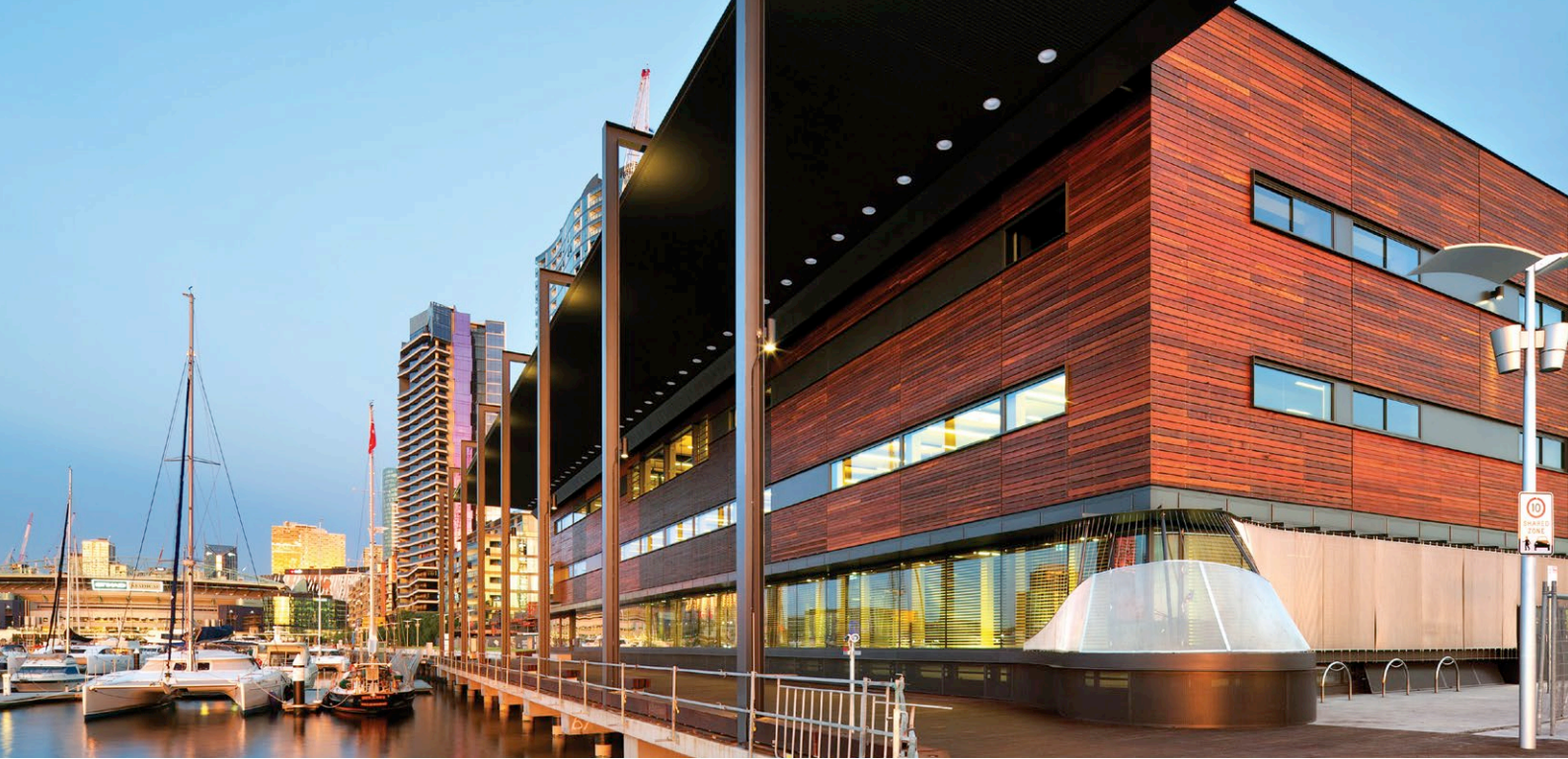
Library at the Dock, Melbourne - helping tackle climate change by storing 250 tonnes of carbon in its wood